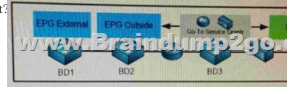
Exhibit. In which bridge domain does enabling hardware proxy have the greatest benefit?

A. BD1 B. BD2 C. BD3 D. BD4 Answer: D QUESTION 93 What must be configured to allow SNMP traffic on ACI switches? A. an out-of-band contract B. an out-of-band management interface C. SNMP relay Policy D. an out-of-band bridge domain Answer: A QUESTION 94 Refer to the exhibit. Which action do you take to ensure that both endpoints are within the same subnet?